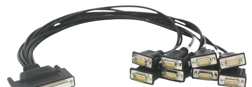
DB37 adapter cable